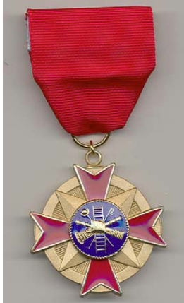
Firefighter Cross Part # A2617FFC Price $ 54.45