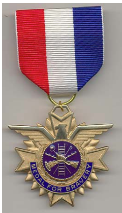
Bravery Medal Part # A2629AMFB Price $ 54.45