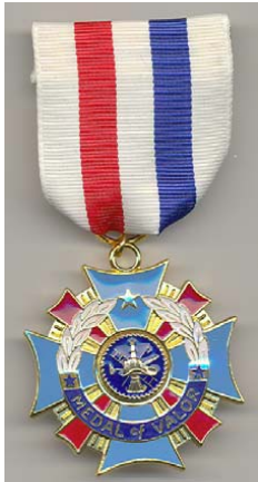
Medal of Valor Part # A4117MOV Price $ 58.95