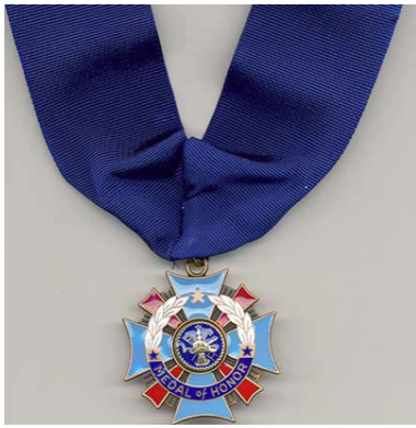
Medal of Honor Part # A4118MOH Price $ 39.60